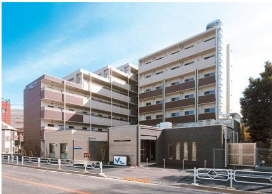
Exterior of the building 外観