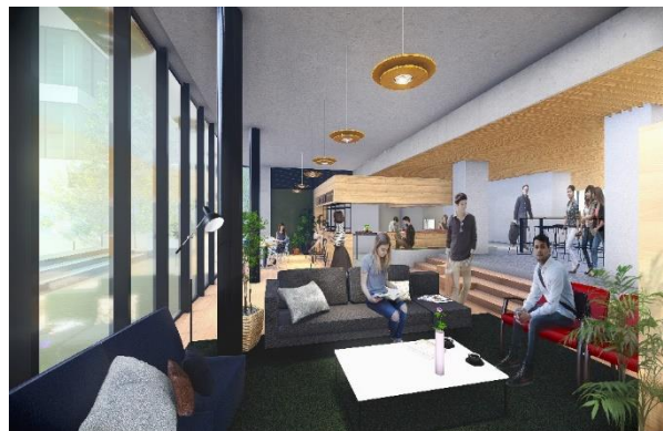
Common living room (image)共有リビング(イメージ)