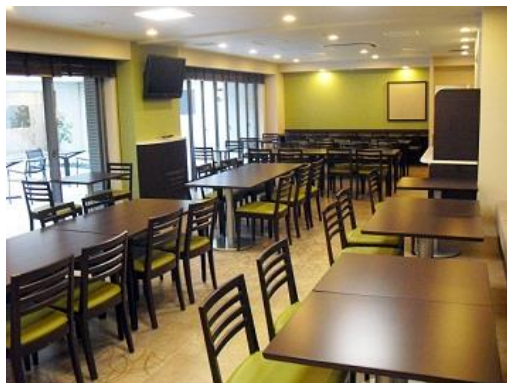
Common dining hall 食堂