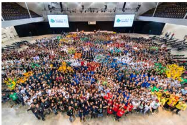
Fig. 1. Giant Jamboree held in Boston in October 2014. Teams attended from 245 universities across 32 countries with more than 2,300 participants.

*Corresponding author: louise.brown@mq.edu.au