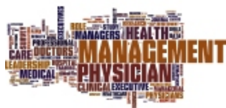
Figure 2: Wordle of key terms

The key topics embedded in these 30 studies was as expected. A wordle (word cloud) was created [ http://www.wordle.net/show/wrdl/2906760/Physician_leadership ].