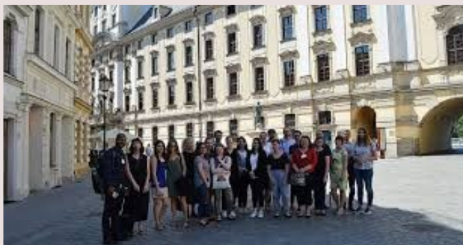
Public History Summer School in Wrocław (Poland, July 2018)

The Steering Committee of the IFPH is committed to support mini-events to encourage deeper understanding of public history internationally. Our aim is to enable public historians from different countries to meet at a specific location to engage with a specific aspect, problem, or issue in public history with local public history practitioners. While we are unfortunately not in a position to offer financial assistance towards the organization of such events, we are able to support grant applications and funding requests. Organizers will be able to draw on IFPH’s extensive international network of public historians to find suitable participants and at least one member of the IFPH steering committee would endeavour to attend the event on a self-funded basis.