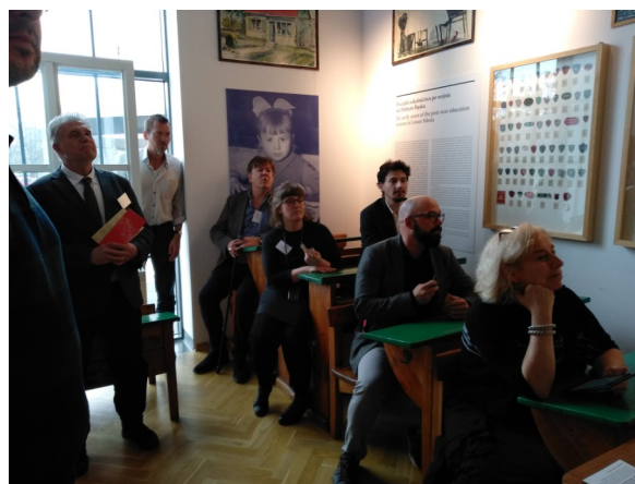
Conference participants touring Wroclaw 1945-2016 exhibit at the Centre.