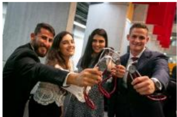
MD Welcome Event

Macquarie University encourages individuals from diverse educational backgrounds who will bring to the profession a variety of talents and interests. No preference is given to graduates with particular bachelor degrees. The GPA indicates the level of performance in the qualifying degree. There is no differentiation of GPA between institutions or programs.