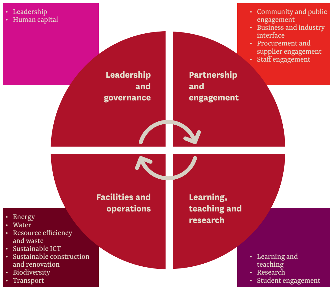
Figure 1: The LiFE Index Priority Areas and Sub-themes

The approach used to embed sustainability across the institution is based on the Learning in Future Environments (LiFE) Index (Figure 1), a performance management framework developed by colleagues across the higher education sector from Australia, New Zealand and the United Kingdom as the best way to address holistic campus sustainability. Without addressing and actioning each of these areas in detail, our university will never become truly sustainable.