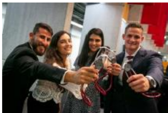
MD Welcome Event

Macquarie University encourages individuals from diverse educational backgrounds who will bring to the profession a variety of talents and interests. No preference is given to graduates with particular bachelor degrees. The GPA indicates the level of performance in the qualifying degree. There is no differentiation of GPA between institutions or programs.