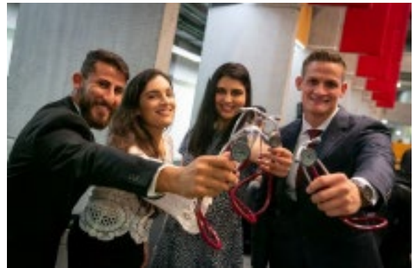
MD Welcome Event

Macquarie University encourages individuals from diverse educational backgrounds who will bring to the profession a variety of talents and interests. No preference is given to graduates with particular bachelor degrees. The GPA indicates the level of performance in the qualifying degree. There is no differentiation of GPA between institutions or programs.