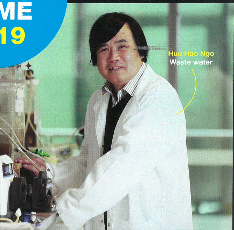
Huu Hao Ngo Waste water