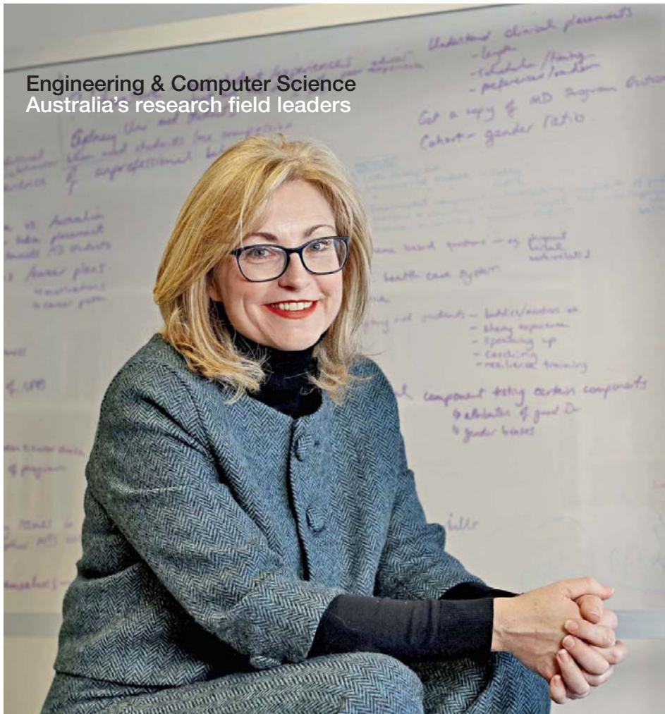
Engineering & Computer Science Australia's research field leaders