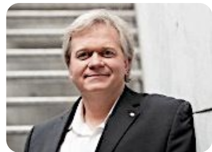
Prof. Brian Schmidt, Nobel Laureate*, *Read more Edition 10

Science is all about curiosity and this curiosity-based knowledge provides the building blocks of future technological breakthroughs. It is not necessarily intuitive that technological revolutions are rarely manufactured, but rather emerge chaotically out of the forest of basic research, current technology, as a brilliant idea. Ultimately knowledge provides opportunity. Opportunity not just to go on the well-travelled road from point A to B, but rather to take a path of discovery to new places. This is the essence of science - a cycle where we learn new things about the Universe, we use this knowledge to transform our own world through innovation, and then use innovations to open up new discovery windows on the world.