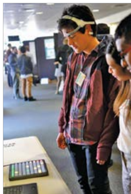
Poster browsing at ACUR 2014

Runners-up for Best Poster Presentation – Book