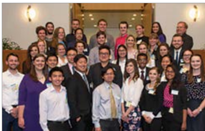
Students who presented posters

The idea of hosting an exhibition of undergraduate student research in Parliament came initially from the USA where "Posters on the Hill" has been a feature of parliamentary life for many years. The aim was to demonstrate to key individuals including Members of Parliament and Senators the quality and range of undergraduate research that is being carried out by showcasing some of the best research through an exhibition of scientific posters displayed in a venue where parliamentarians and others can readily access them.