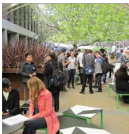
ACUR Morning Tea

zying array of disciplines, from astrophysics to neuroscience, ancient history to music, business studies to law, and much in between. All sessions were exceedingly well attended and question times were distinguished by the quality of the questions. A workshop: Publishing your Research was held as part of the conference program. The highlight of the social program was the conference dinner, attended by 120 conference participants.