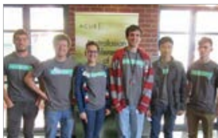
ACUR2014 Student organisers

The research topics covered were across a diz-