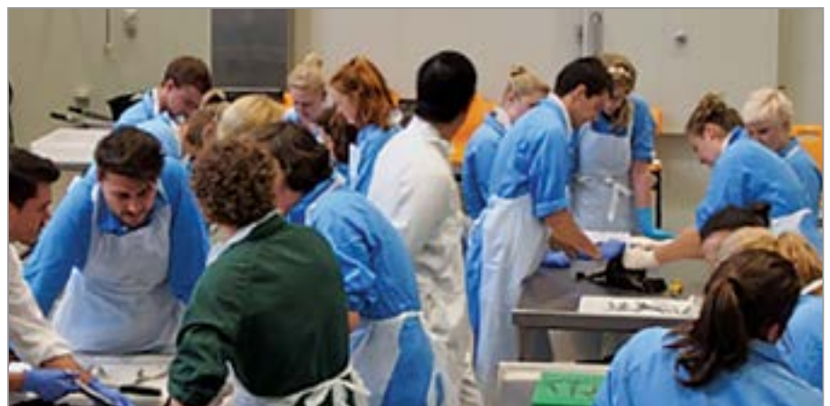
Third year veterinary students receiving instruction from fifth year veterinary students in pathology skills.

Evaluation of the student and staff experiences in this initiative will be undertaken as part of the Learning and Teaching Grant research project and will inform ongoing improvements to the assessment design and teaching approaches in the course.