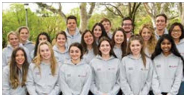
The inaugural cohort of Hallmark Scholars

The Program introduces students to research from their first semester at university and is designed to allow them to progressively develop their research skills and knowledge. This initial year has exposed students to a variety of academic staff and postgraduate students across a range of RFA topics, exposing students to possibilities they had not considered.