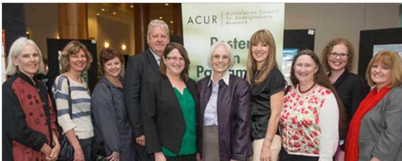
Some members of the ACUR Steering Group at Posters in Parliament on 22nd September 2014

I hope you enjoy this bumper issue of URNA and look forward to receiving your comments.