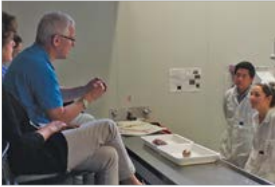
Pathology rounds presentation discussion between a clinician and veterinary students.

to help support the innovative use of technology and the effective use of the new necropsy suite during 2014. The team is working with an academic developer to guide the pedagogical research aspects of the project. The grant is supporting the purchase of audiovisual enhancements and increased histology services to augment teaching and understanding for the student diagnosticians.