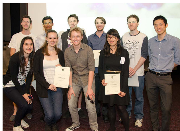
Some of the prize-winners at ACUR 2013