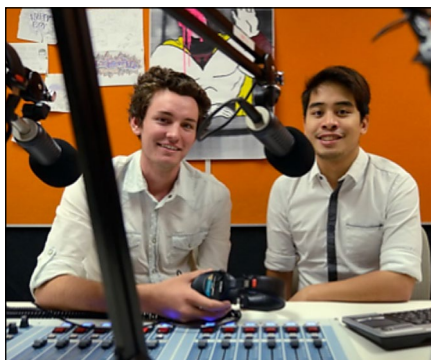
Students participating in the global Television Media Lab at UQ