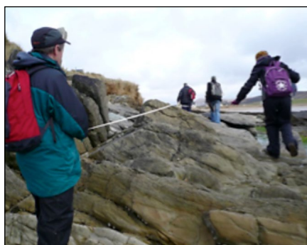
Images show geology students working along the coast near Ballyferriter, The Dingle Peninsula, Co. Kerry, Ireland. This is a 4 day residential field-based experience. The small groups all come back to the field base in the evening to discuss their findings.