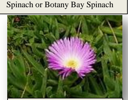
Carpobrotus glaucescens – a more typical member of the Aizoaceae plant family