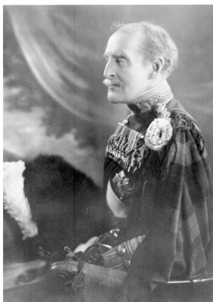
General Sir Ian Hamilton (1853-1947)

From Sir I. Hamilton, Gallipoli Diary (London, 1920) 28: